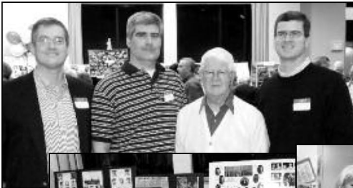
Marquette Catholic High School